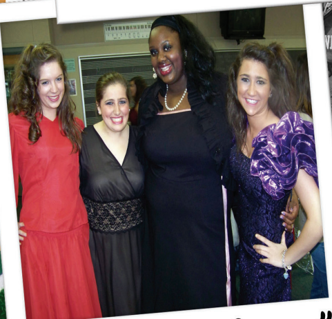
"THE WEDDING SINGER"