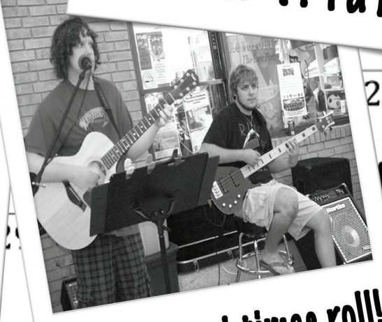
Let the good times roll!